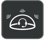
Acoustic Shield Technology

The Yealink WH62 is a new entry-level DECT wireless headset, with WH62 Dual and WH62 Mono two models. Work seamlessly with major UC platforms and integrate natively with Yealink IP phones. For crystal sound experience, Yealink Super Wideband Technology and Acoustic Shield Technology make you talk and hear clearly during phone calls and video conferencing. With easily on-ear control, interruption free, comfortable wearing, WH62 is a nice partner either for communicating or collaborating.