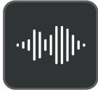
Optima Audio Experience