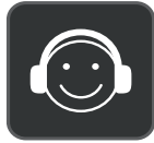
All Day Wearing Comfort