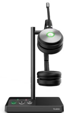
WH62 Dual Teams WH62 Dual UC

Based on hundreds of headform evaluations and thousands of wearing comfort tests, WH62 well meets the ergonomic requirements. Besides, with premier soft leather cushions and lightweight design, you can wear it all day comfortably. For more workspace freedom, WH62 can also free you up to 160m away from the desk.