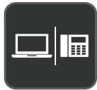
Multiple Devices Connection