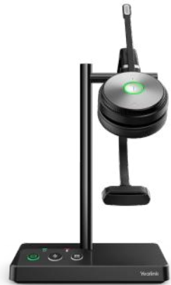
WH62 Mono Teams WH62 Mono UC