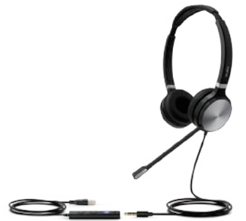
UH36 Dual Teams UH36 Dual UC