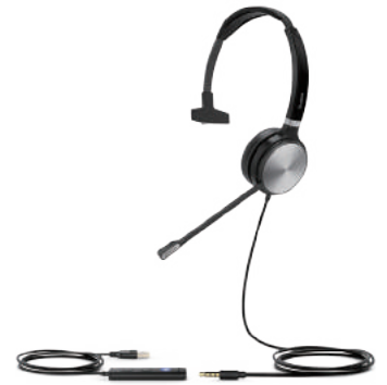
UH36 Mono Teams UH36 Mono UC

Deeply integrated with Yealink IP phones that the advanced features, such as volume synchronization and multiple calls control, are just right at your fingertips.